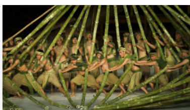
Hoi An Memories Show AU$116