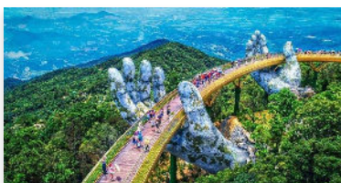
Golden Bridge Tour AU$183