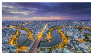
Dinner on Saigon River Cruise AU$135