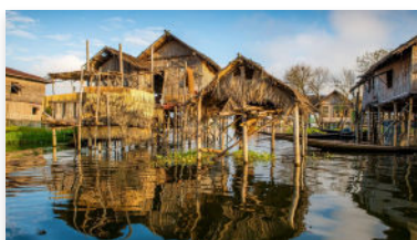
Tonle Sap Lake Tour AU$136