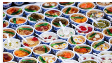
Hoi An Cooking Class Tour AU$112