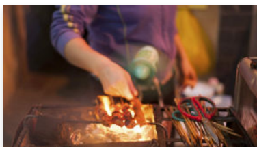
Hanoi Street Food Tour AU$85