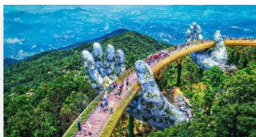
Golden Bridge Tour AU$183