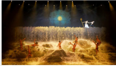
Beijing Golden Mask Dynasty Show AU$90