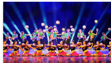
Shanghai Chinese Acrobatic Show AU$105