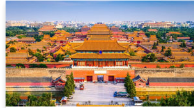
Forbidden City Tour AU$80