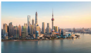
Shanghai Insight Tour AU$70