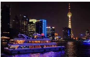
Huangpu River Cruise AU$80