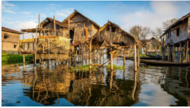
Tonle Sap Lake Tour AU$136