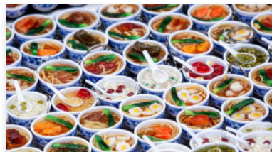
Hoi An Cooking Class Tour AU$112