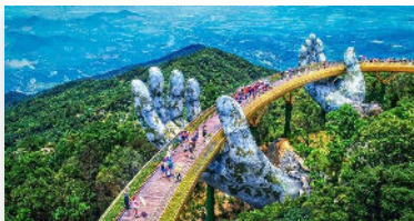
Golden Bridge Tour AU$183