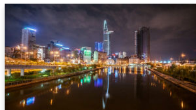
Dinner on Saigon River Cruise (Dinner Included) AU$135