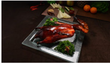
Peking-duck Banquet Dinner AU$50