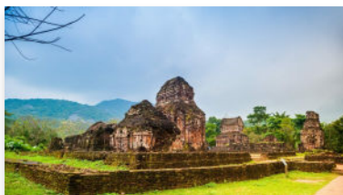
My Son Sanctuary and Thanh Ha Village Tour AU$93