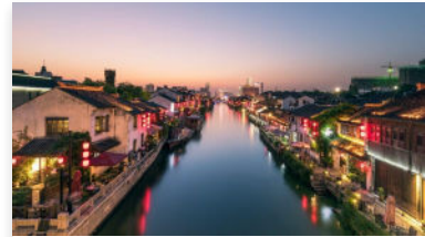
Wuxi Grand Canal Cruise AU$80