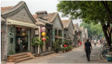
Hutong Life Tour AU$40