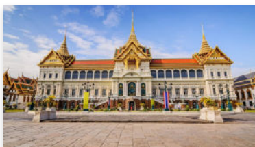
Half Day Royal Grand Palace Tour AU$98