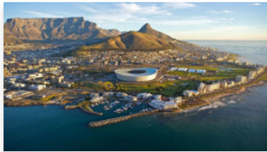
Table Mountain, Cape Peninsular & Costantia Winelands