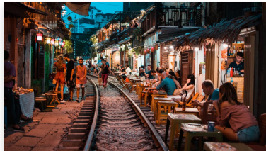
Hanoi Street Food (Dinner included) $95