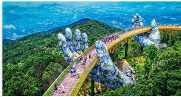
Golden Bridge Tour $193