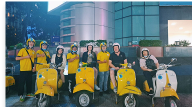
Vespa Adventure - Saigon After Dark $223