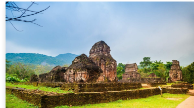
My Son Sanctuary and Thanh Ha Village Tour $160