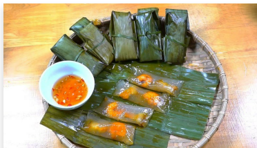
Hue Street Food Tour by Cyclo $112