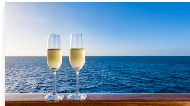
Sunset Cocktail & Dinner Cruise - Nha Trang $138