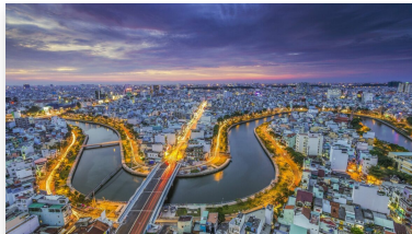
Dinner on Saigon River Cruise $140