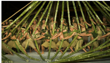
Hoi An Memories Show $120